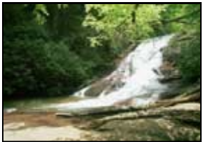
Lower Helton Creek Falls

Trail Information: The Helton Creek Falls Trail is an easy .2 mile hike. The lower falls drops over a 30' ledge, tumbling to a pool below. The second upper falls is a tall, full falls that drop at least 60 feet. Please be advised there are many abrupt changes in grade along this short walk. Please stay on the trail and observation deck!