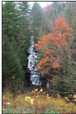
Waterfalls at Vogel State Park